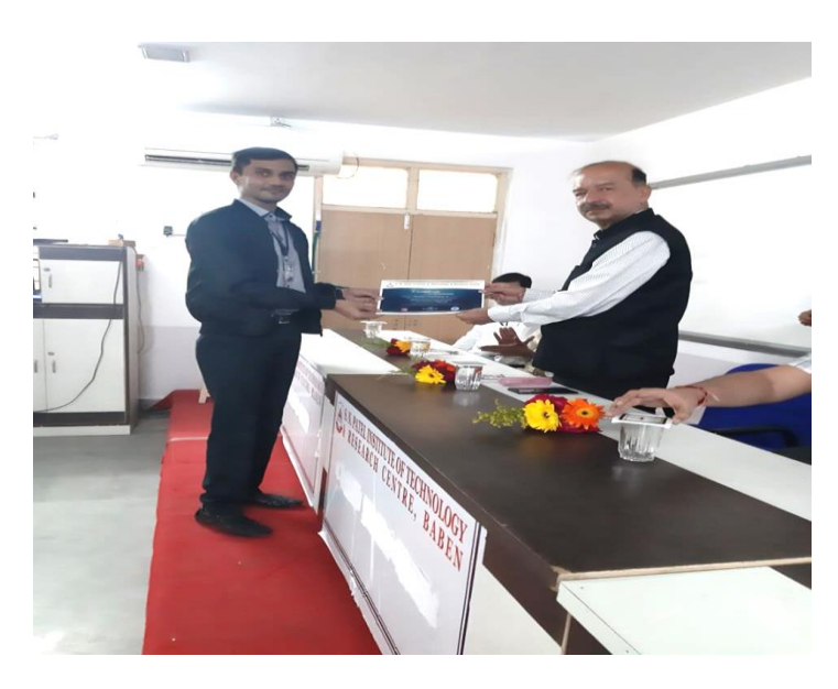
Certificate Distribution during Valedictory