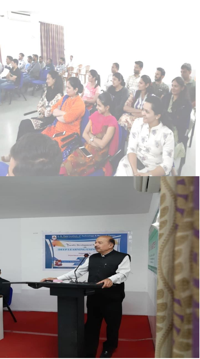
Executive Secretary, ISTE New Delhi at Valedictory Session